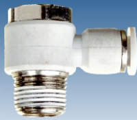
MALE BANJO CONNECTOR