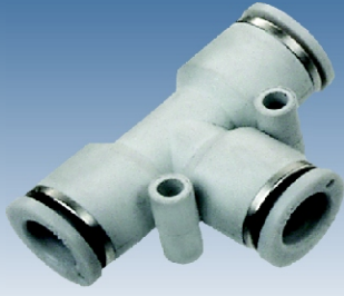
PEG T DIFFERENT UNION TEE