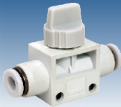
HAND VALVE 2/2 UNION STRAIGHT